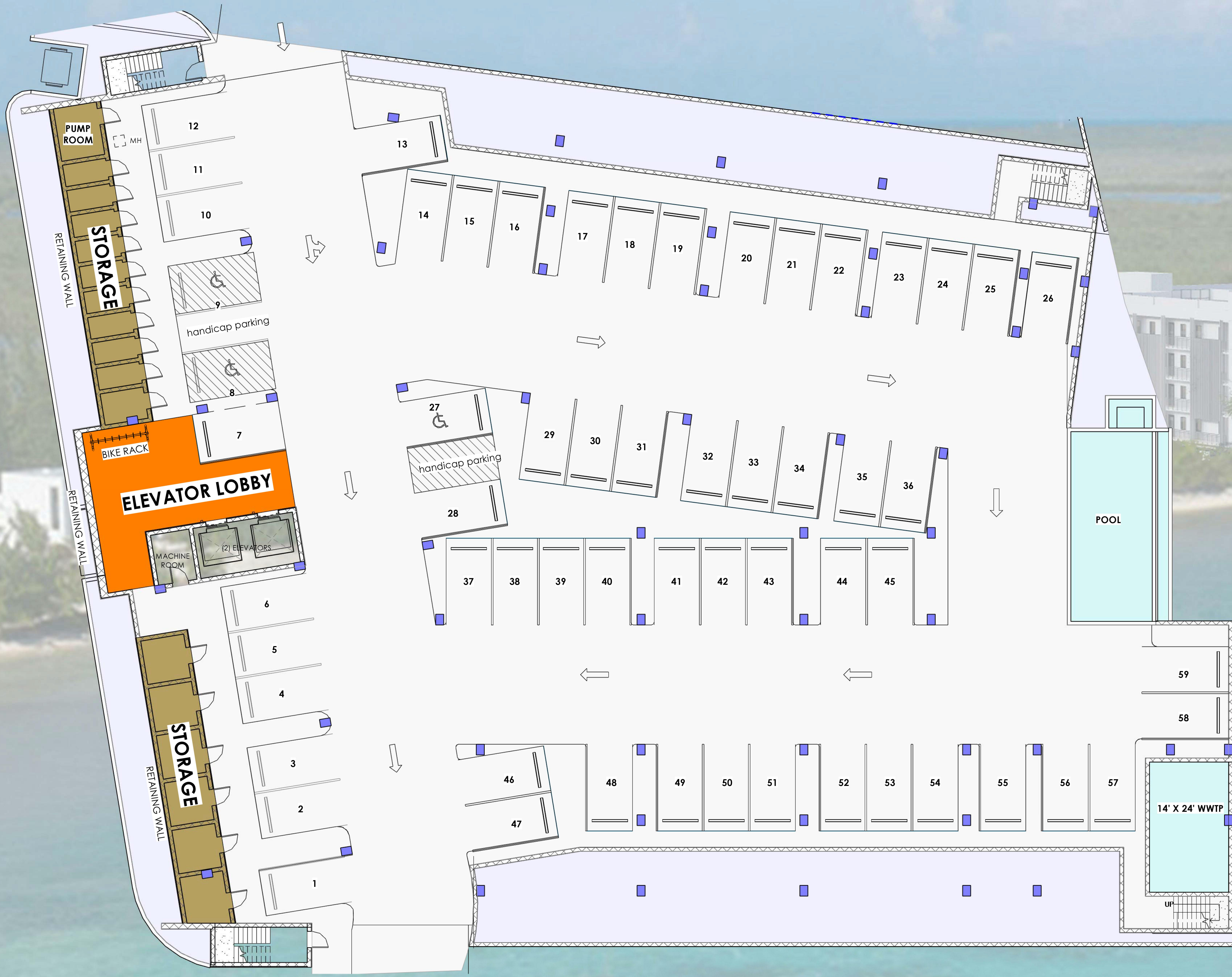
Ground Floor - Parking & Storage