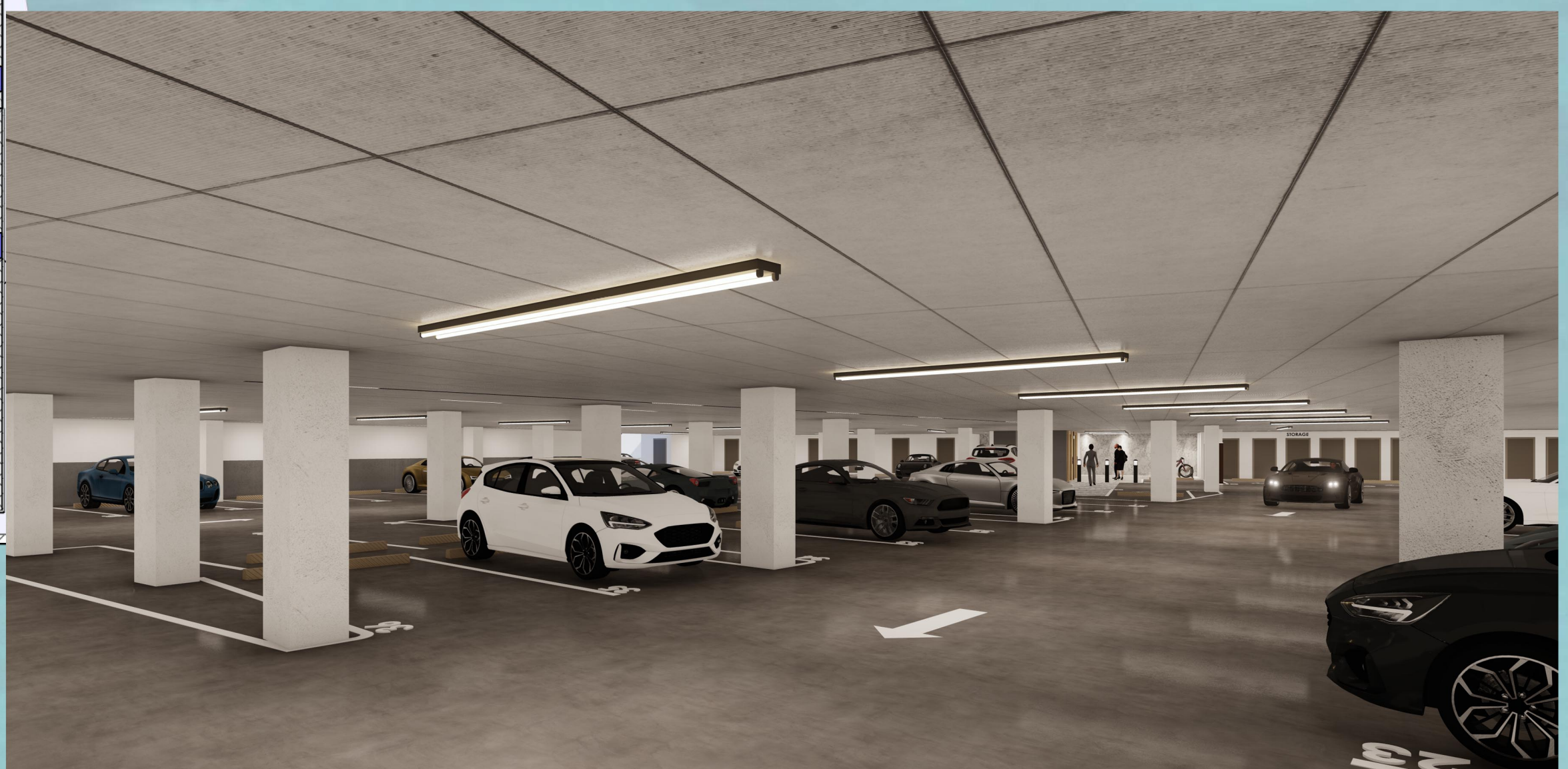
3D View 03