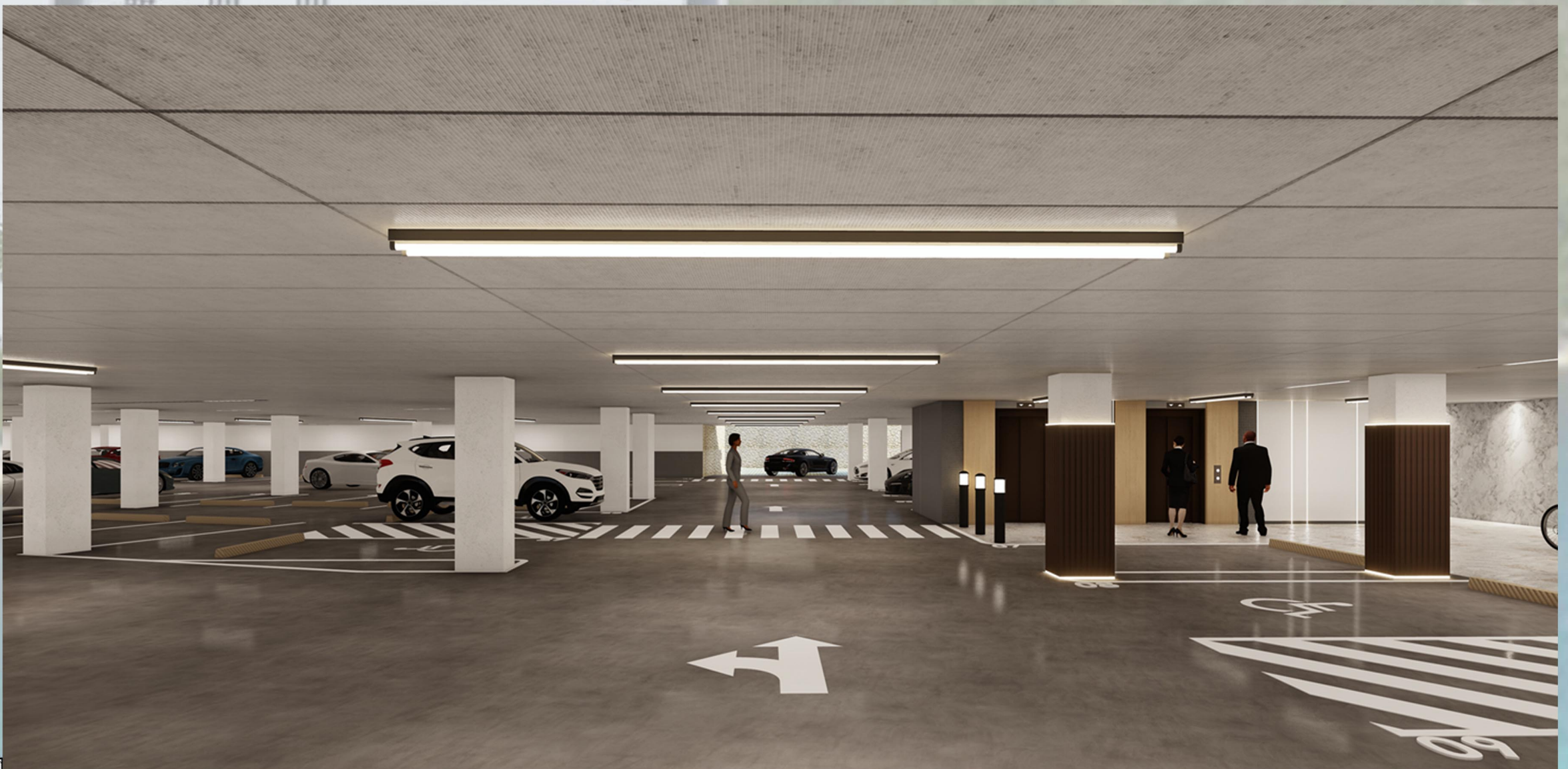
3D View 02