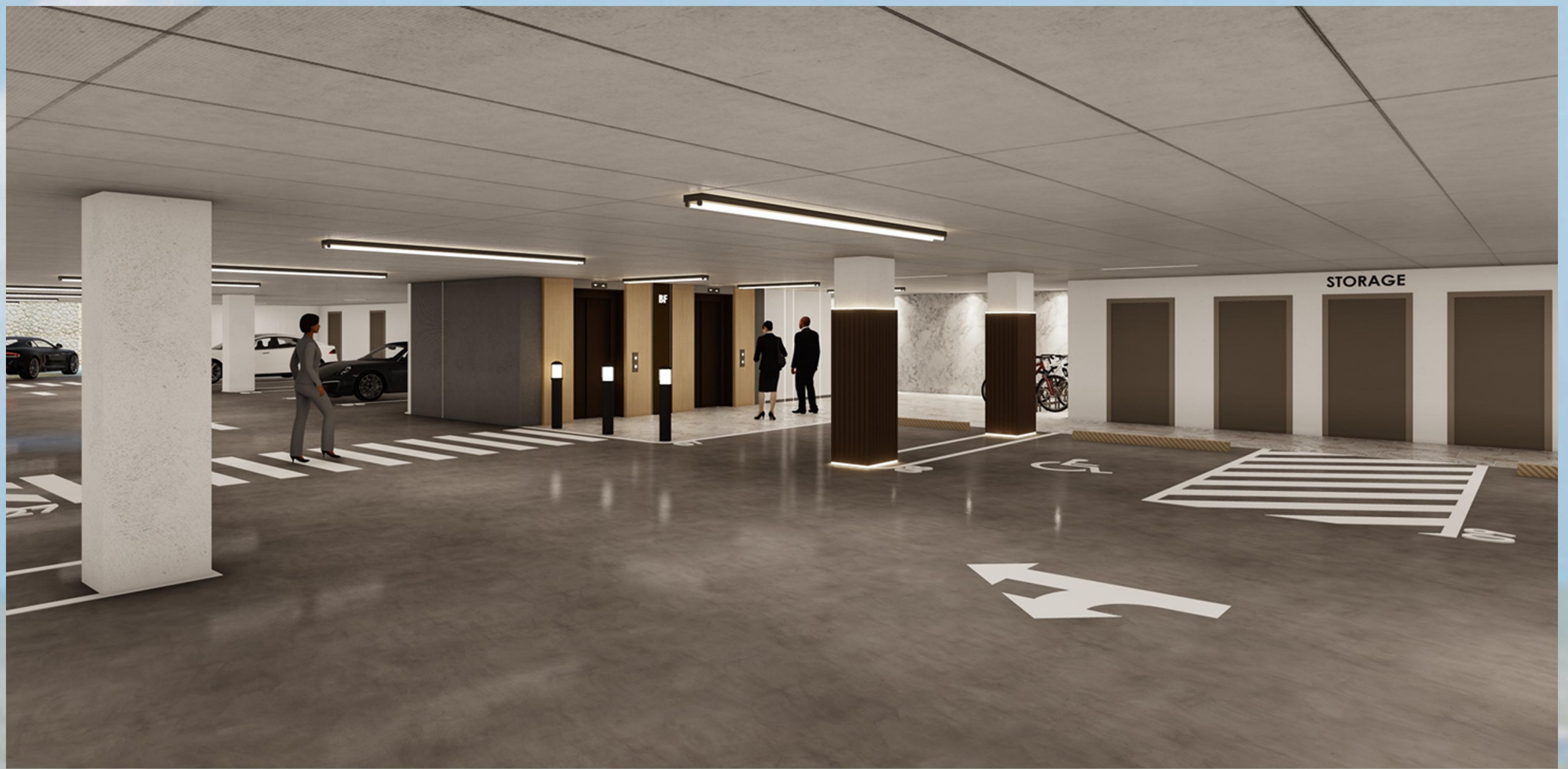
3D View 01